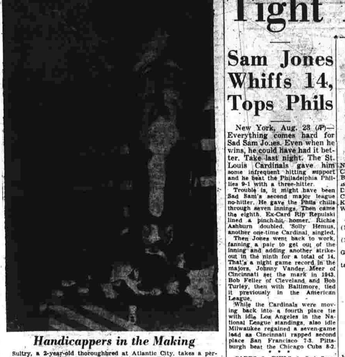
Handicappers in the Making Sultry, a 2-year-old thoroughbred at Atlantic City, takes a personal interest in the stable's canine mascots. The temperamental race horse enjoys the companionship of his little pets who share his living quarters at the New Jersey oval.